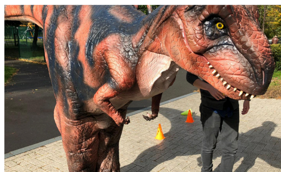
An Interesting Visitor