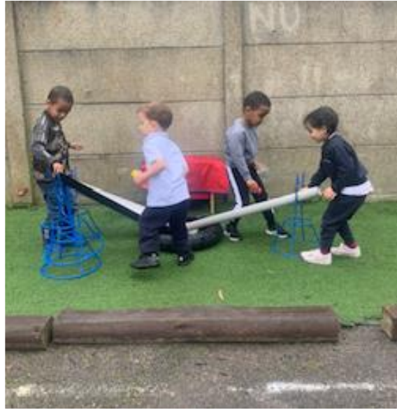
Experimenting with car rolling