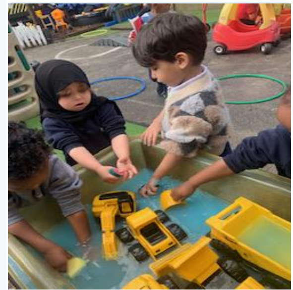
Giving our dirty diggers a wash!