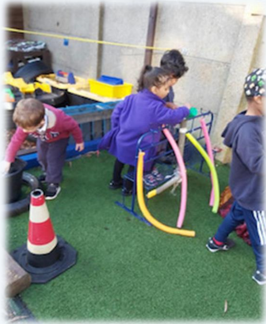
Having a go!