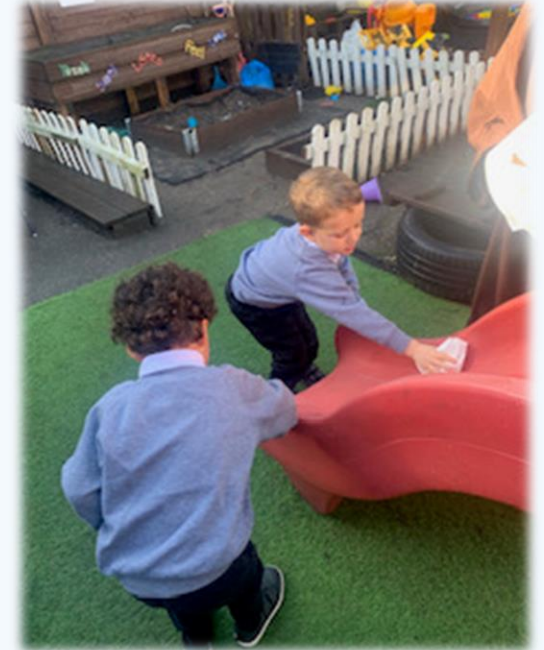
Helping ustadha clean the slide