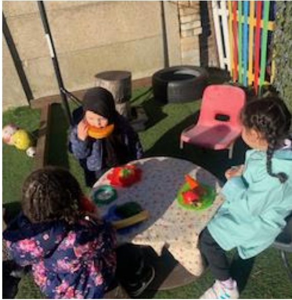
Having a picnic