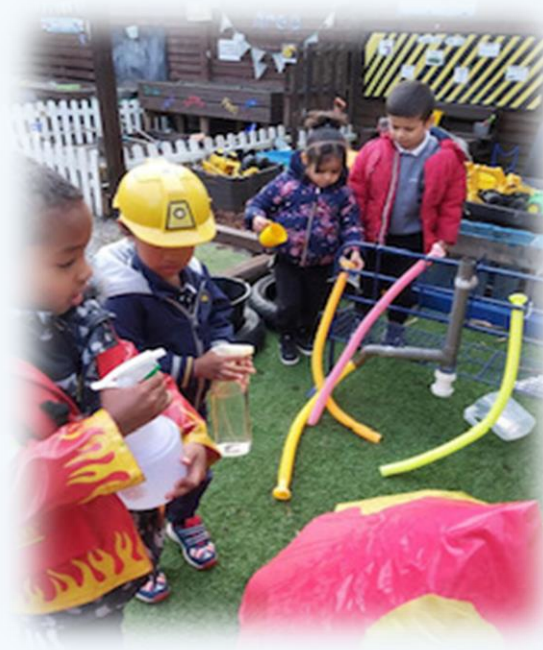
Putting out fires