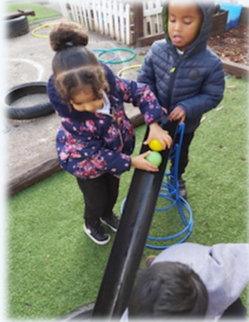
Using our gross motor skills